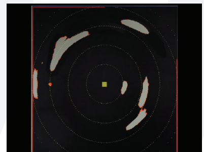
Sonar view spotlighting icebergs surrounding vessel