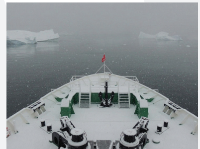
Research vessel with icebergs in forward view.