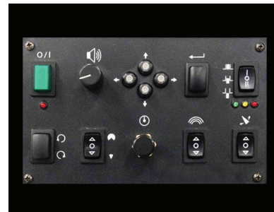
Main control panel