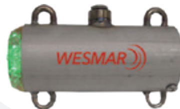
Trawl light inside of its stainless steel carrier – ready to mount.

WESMAR knows about the challenges of weight and size because of our catch sensors, considered the most rugged in the industry, yet the lightest of weight. Using this knowledge we designed a trawl light that slips into a WESMAR stainless steel carrier. They attach to the net and are lit with a long-life battery.